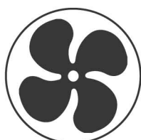
DRS 16 EXTRACTION SYSTEM