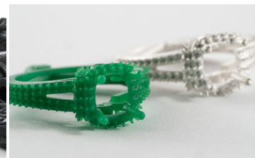
Figure 4 JCAST-GRN 10