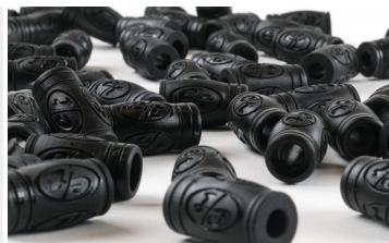
Figure 4 ELAST-BLK 10