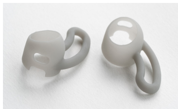
Figure 4 TOUGH-GRY 15